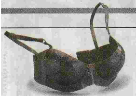
Dunia, an "earth-friendly" store on Maynard's Nason Street, has been raising eyebrows with its latest exhibit, "Unmentionables."